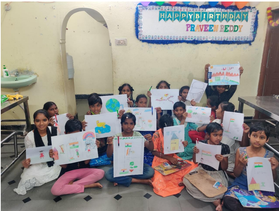
Paintings of the Children