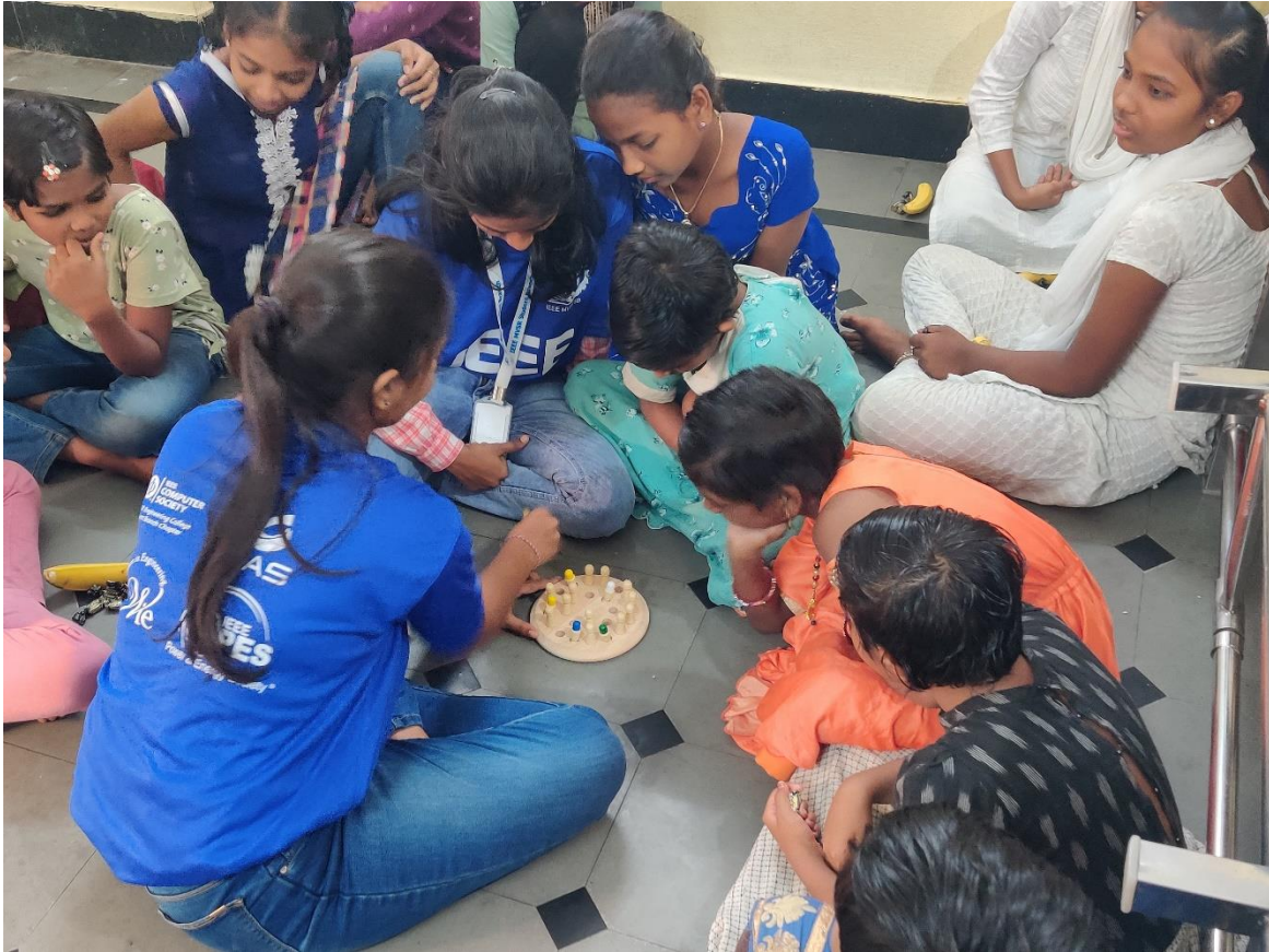
Interaction with Children

IEEE MVSR SB understands its responsibility towards society and have taken an initiative to support the orphanage by providing them necessities, interacting with the children virtually and knowing their concerns amidst third way of Covid -19 prevalent in country and positivity rate reaching new heights.